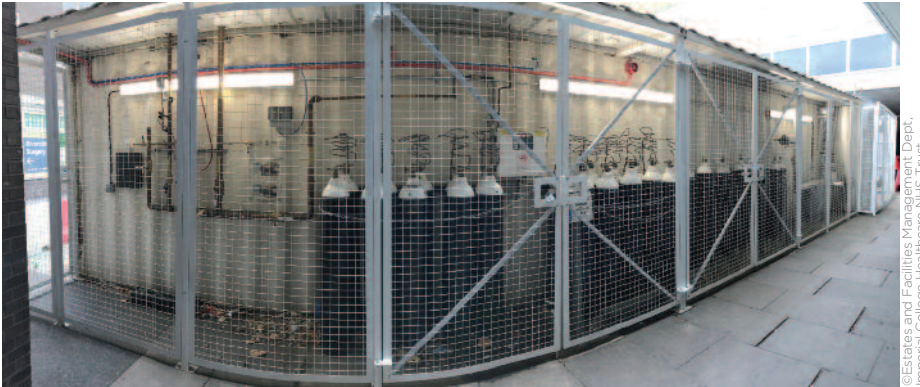
The oxygen concentrator connection and distribution manifold, and emergency standby manifold, arrangement.

The hospital decided to allocate the concentrator to one of its blocks, the Riverside Wing, which houses the hospital's Acute Medical Admissions