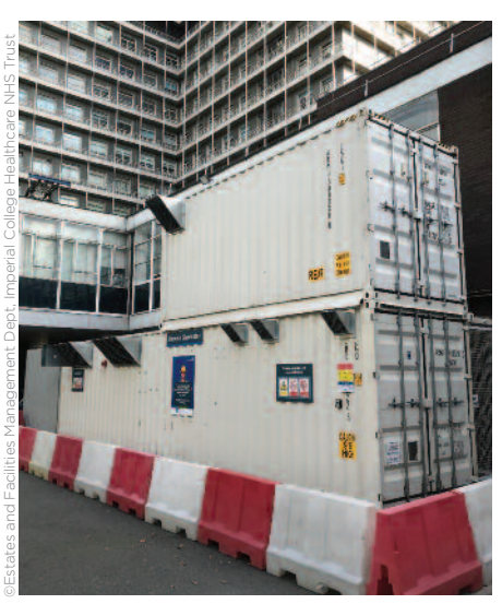
The container-sized plant room solution strategically located adjacent to the oxygen load.

A team including engineers from the Trust, SHJ, project managers, ETA Projects, and supplier, Atlas Copco, began sourcing all the plant, pipelines, and electrical supplies required at the beginning of April. Working around the clock, seven days a week, engineers