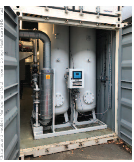
Oxygen generator vessels.

Unit, Day Surgery Ward, theatres, and Recovery, and in which new COVID beds had hurriedly been placed. Pipework was laid to enable the concentrator to supply the block independently, while retaining the connection to the main VIE to allow maximum flexibility. It also allowed generated oxygen to be supplied to the entire hospital site via a ring main in the event of total failure of the VIE.