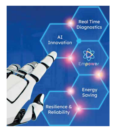
The key benefits of SHJ's Empower system graphically illustrated.

As part of the system, there are two dryers, eight compressors, and two control panels. The system has been constructed so that if anything fails, there are back-up failsafes, so that in