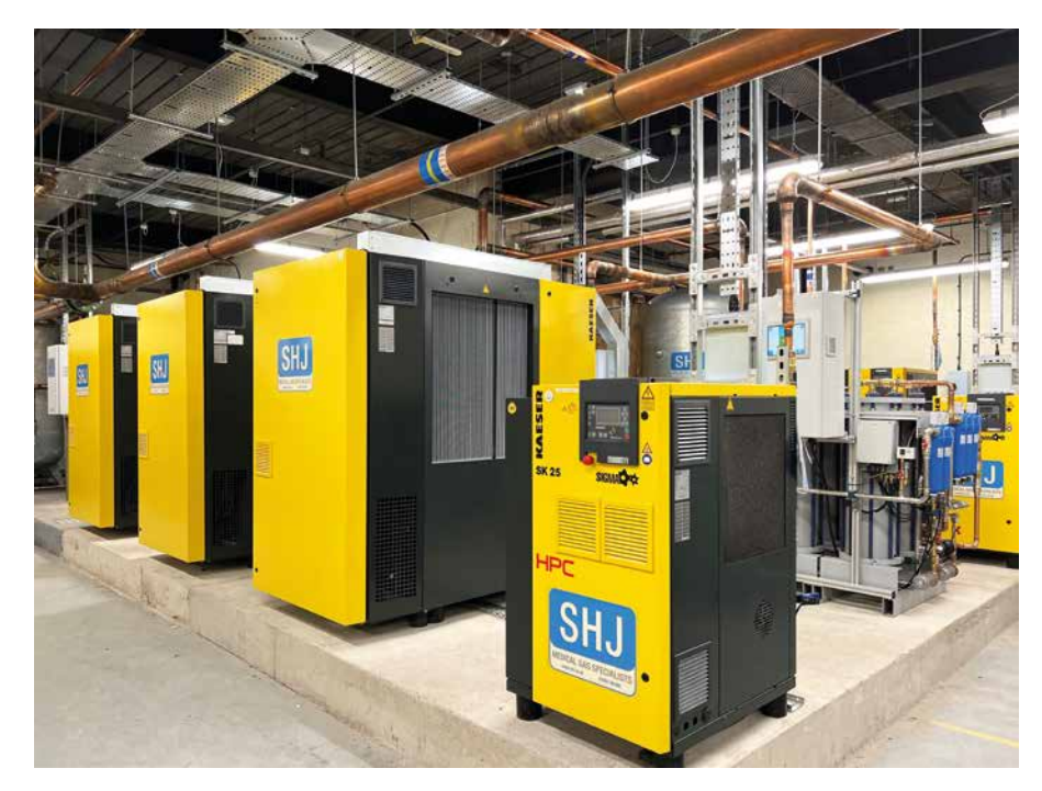
The RVI's medical gas plant room.

For example, during the day, more air is used at the RVI due to use by the hospital's Dental School, and consumption of industrial air, which may require up to 40 kW in terms of power usage. However, during the evening and overnight, when both the Dental School and the Outpatients' Department are closed, the